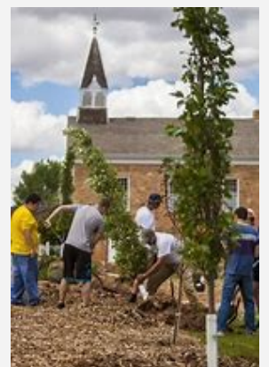
Parowan youth helping plant trees near the Parowan Old Rock Church

Mark your calendar and spread the word! Watch for more information coming and be ready to experience some Mother Town Magic!