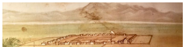
(Parowan Fort, Wooden Version) 851-1872 Drawing at the Pipe Spring National Monument)

We welcome everyone to participate, reconnect, and contribute to preserving the legacy of Parowan Old Rock Church. Join us for a weekend of fun, reflection, and giving back as we celebrate Parowan's history and preserve its future. Please mark June 20 - 21 on your calendar and invite a few friends and family both in town and out of town. Let's make this a wonderful event!