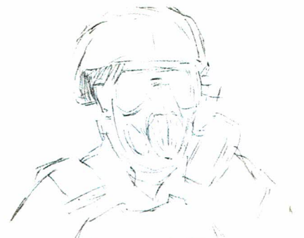
Whitney Jones' drawing of Officer Townsend in full SWAT gear including gas mask.